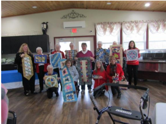
Finished "Rip It" projects